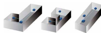
Room1: L Type