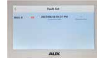
Central Controller (Optional)